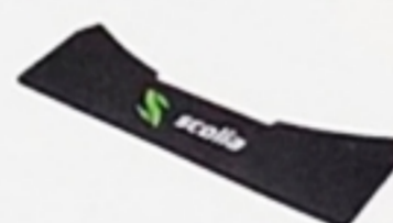
Cover plate 1x