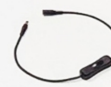
DC cable with power on/off switch - 1x