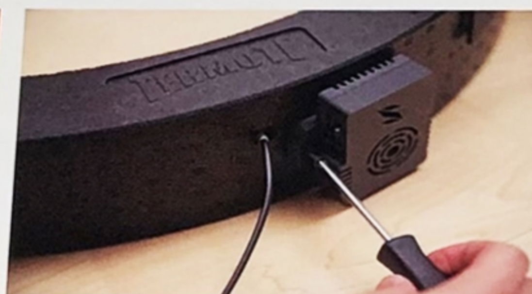
2 Attach the processing unit