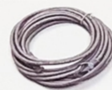
LAN Cable 1x