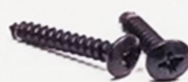
Round head screws for the cover plate - 2x