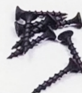
Black coarse threaded screws 8x