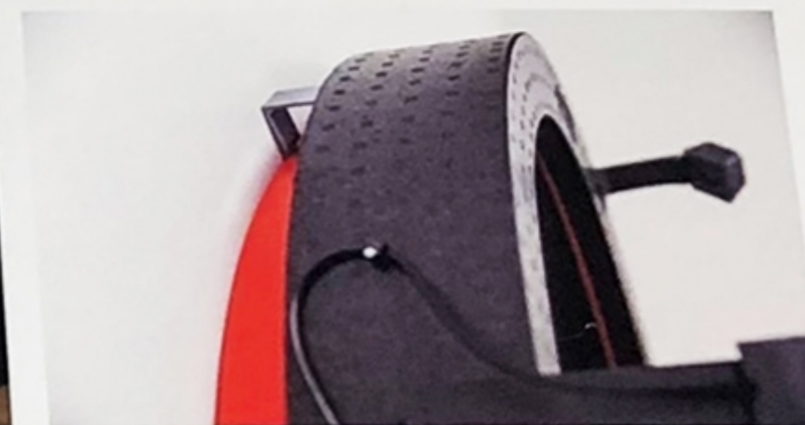
4 Hang the Termote on the surround