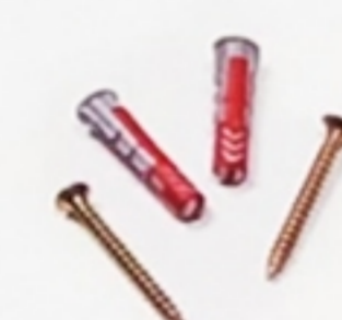
Coarse threaded screws with rawl plugs - 2x