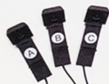
Camera holding legs 3x