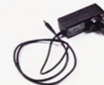
Power supply (5V, 4A) 1x