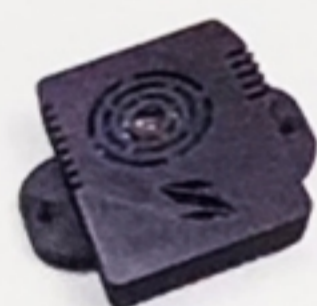
Processing Unit 1x