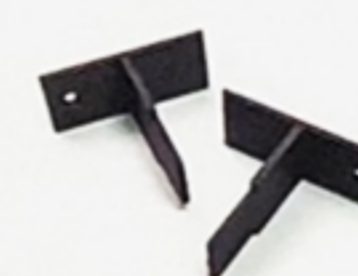
T-shaped support brackets 2x