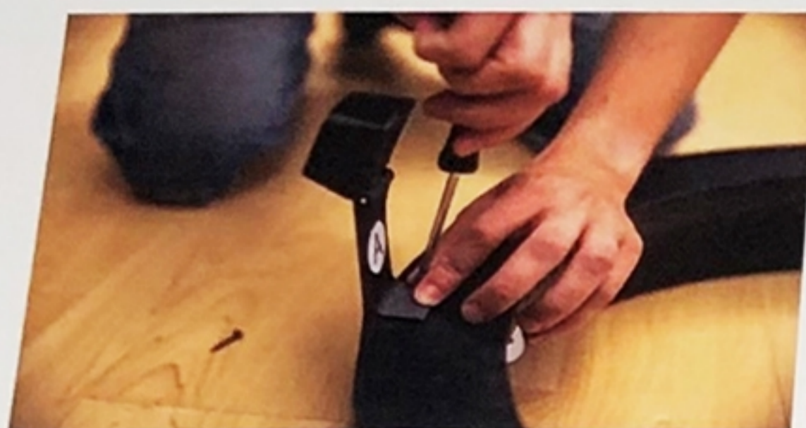
1 Attach the cameras