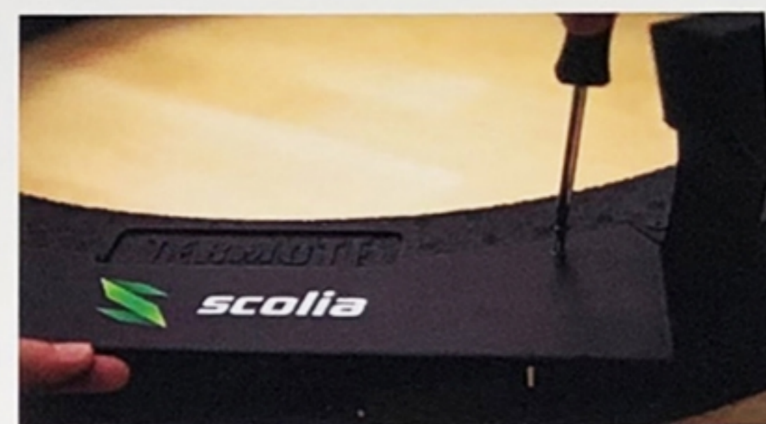
3 Attach the cover plate