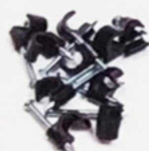
Cable clips 10x